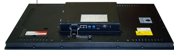
Back side with electronic cover