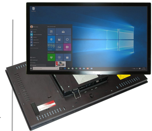
FlatMan AE320 with color bezel front with PCAP Multi-Touch-Glass-Front