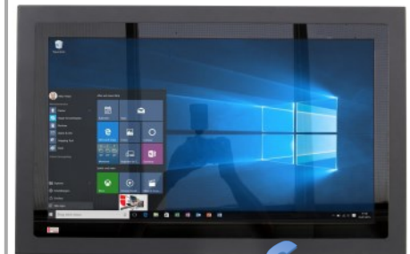
Complete closed housing