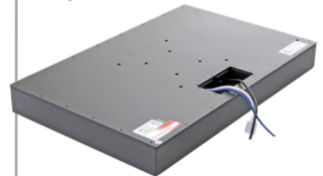
Front side—Glass Multitouch same level as metal . Front bezel